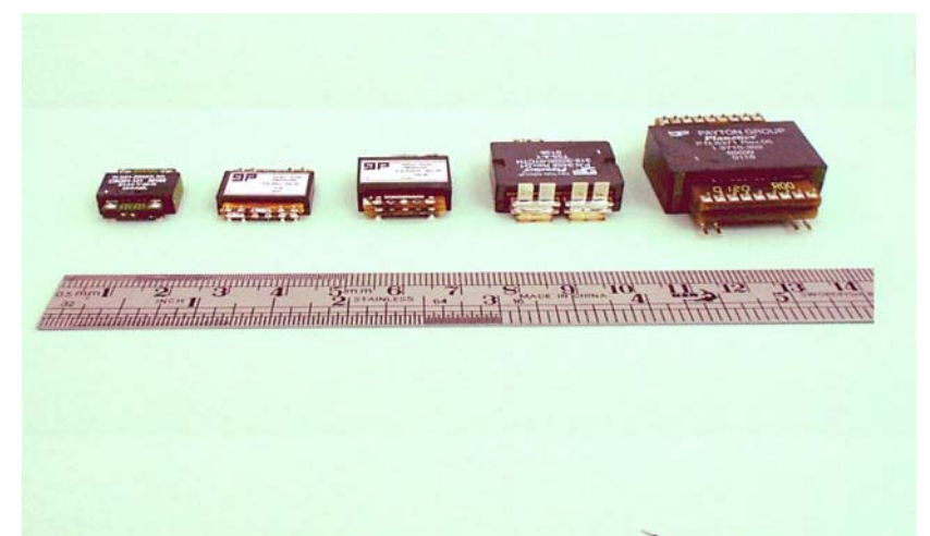
Picture 1: Transformers of Various core sizes: 20, 32, 40, 55 and 80 (left to right).